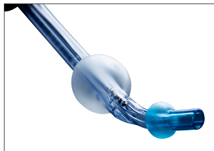
Ambu® VivaSight™ 2 DLT