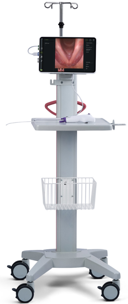
Ambu® aScope™ 4 RhinoLaryngo Slim and Ambu aView™ 2 Advance on Ambu aCart™ Compact

* aScope 4 RhinoLaryngo Slim is not available for sale in all countries. Please contact your local Ambu sales representative.