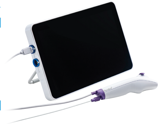
Ambu aScope 4 RhinoLaryngo Slim and Ambu aView 2 Advance

aScope 4 RhinoLaryngo Slim is always comfortable to hold thanks to its lightweight and ergonomic design