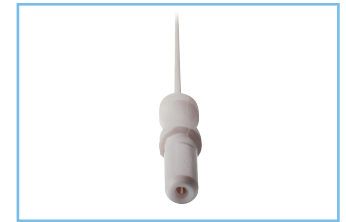
K = 1.5 mm connector