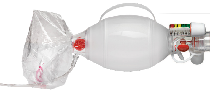
Ambu Disposable Pressure Manometer connected to Ambu SPUR II Resuscitator

The Ambu Disposable Pressure Manometer is suitable for use with Ambu resuscitators or other resuscitators, hyperinflation bags, CPAP masks or circuits.