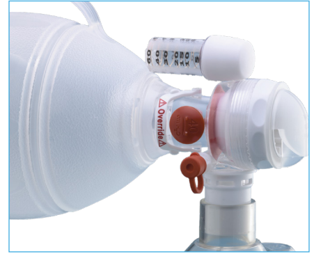
Ambu Disposable Pressure Manometer connected to Ambu SPUR II Pediatric