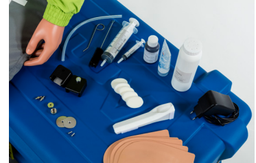
Accessories Included in Packaging