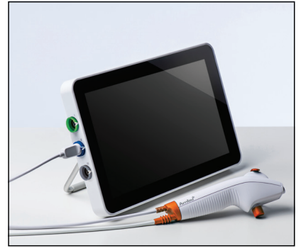
Ambu aScope 4 Broncho Large and Ambu aView 2 Advance