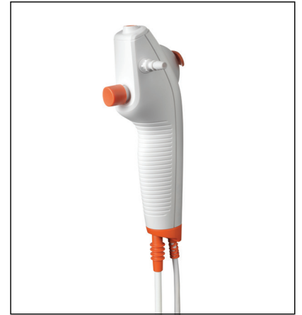
The ergonomic and lightweight handle is designed to give you a firm and comfortable grip