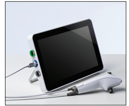
Ambu aScope 4 Broncho Slim and Ambu aView 2 Advance