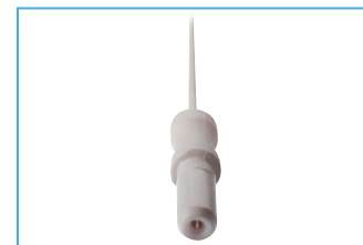
K = 1.5 mm connector