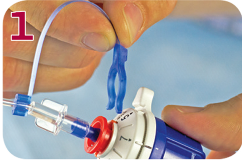
1 Remove blue lock guard.