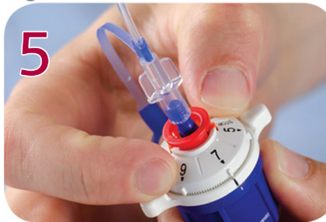
5 Push the white dial back in place to set flow rate. Avoid pressing the red ring at all times.