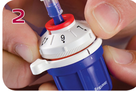
2 Gently pull white dial up on regulator.