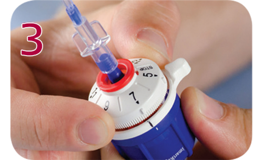
3 To set the Regulator to desired flow rate, rotate the white dial and align with black position indicator. Increase flow rate turn counter clockwise. Decrease flow rate turn clockwise.