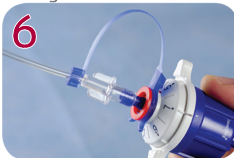
6 To secure flow rate temporarily, insert blue lock guard between the red ring and the white dial.