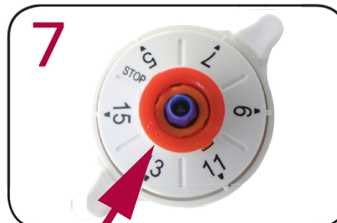
7 Please DO NOT Touch the RED Locking Ring