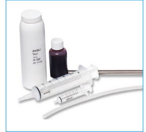
Accessories for Ambu IV Trainer