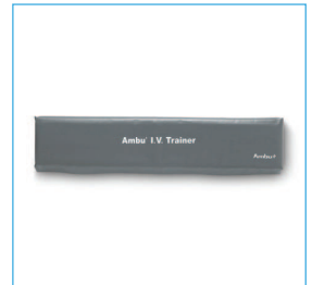
Packed in a robust bag