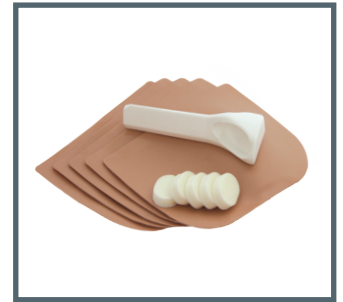
Kit i.o. Access