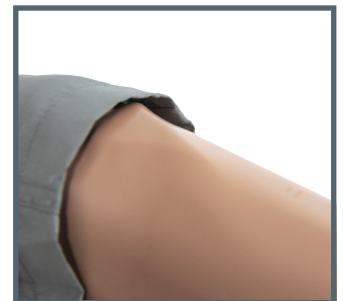
Realistic anatomic landmarks