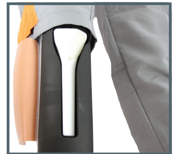
Kit i.o. Access