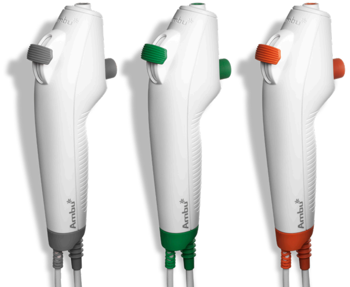
aScope 4 Broncho Slim 3.8/1.2 180°/180°

Includes three sizes for multiple procedures and the aScope BronchoSampler, a tailor-made solution that helps simplify the sampling process