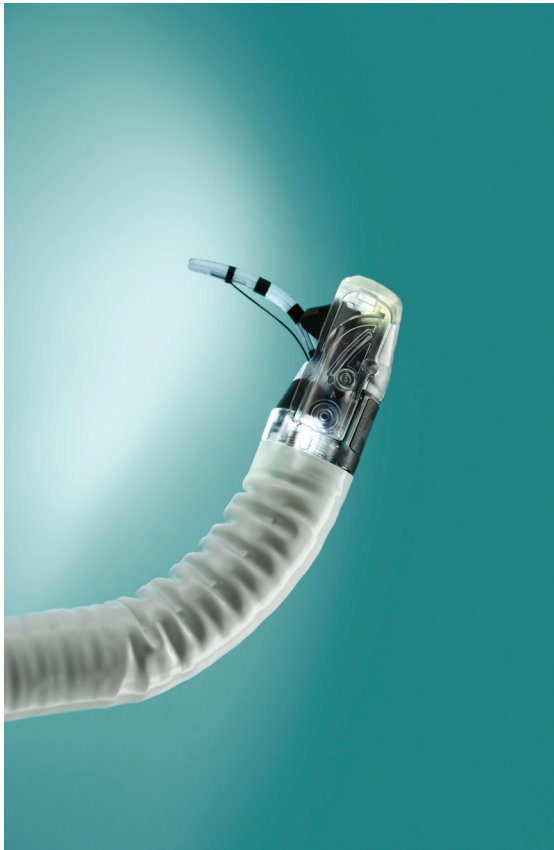
Distal tip showing elevator in use with a sphincterotome

What's more, there's no need for costly reprocessing or repair.